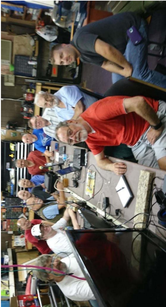
Some members of the WAX Group