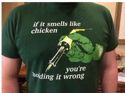
Join the group to learn how to solder