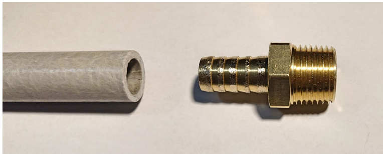
Top mast section and 1/2 inch to 1/2 inch adapter

I had to file the ridges slightly so that it would fit snugly so it can't turn, but not too tightly into the mast top section as it could crack the fibreglass.